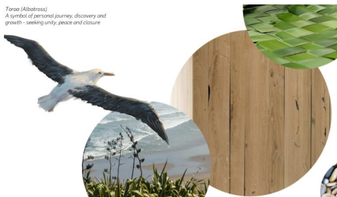
Toroa (Albatross) A symbol of personal journey, discovery and growth - seeking unity, peace and closure

Construction has begun on a dedicated space for public hearings in Auckland. The premises in central Auckland have been designed with survivors in mind and the concept of the toroa, whānau and kaitiakitanga - respect for the environment and culture. The space makes the most of natural resources and has been designed in a way that is mindful of those that will be using it;