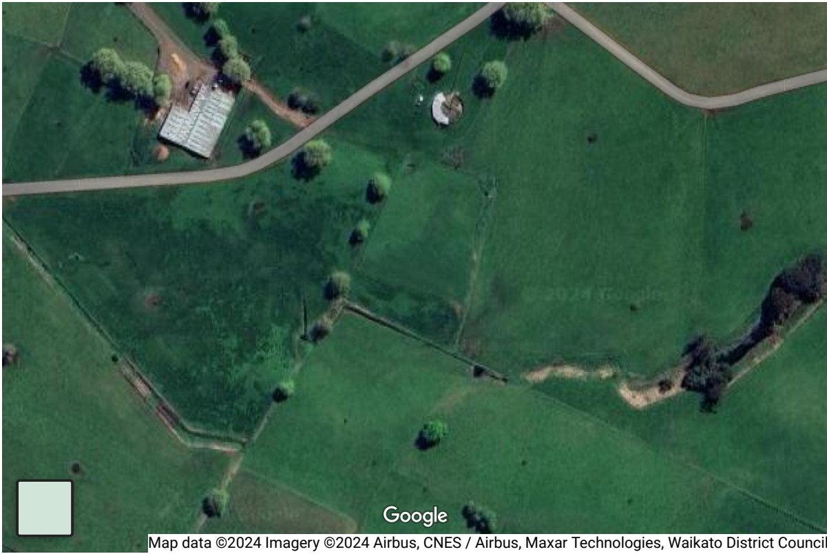
Map data ©2024 Imagery ©2024 Airbus, CNES / Airbus, Maxar Technologies, Waikato District Council